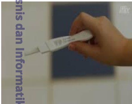
Picture 8 Tespac

Sexual intercourse should only be done for married couples. This is because sexual intercourse is a way to have children. In having children, in Indonesia, you must first get married. Having offspring must be accompanied by mental readiness because when we have children we as parents must be responsible for taking care of and many things.